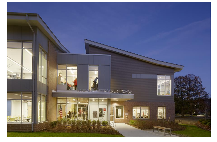
Randolph Intergenerational Community Center (26,300 SF)