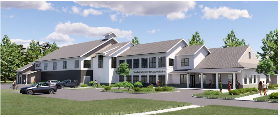
Sandwich Center for Active Living (24,000 SF)