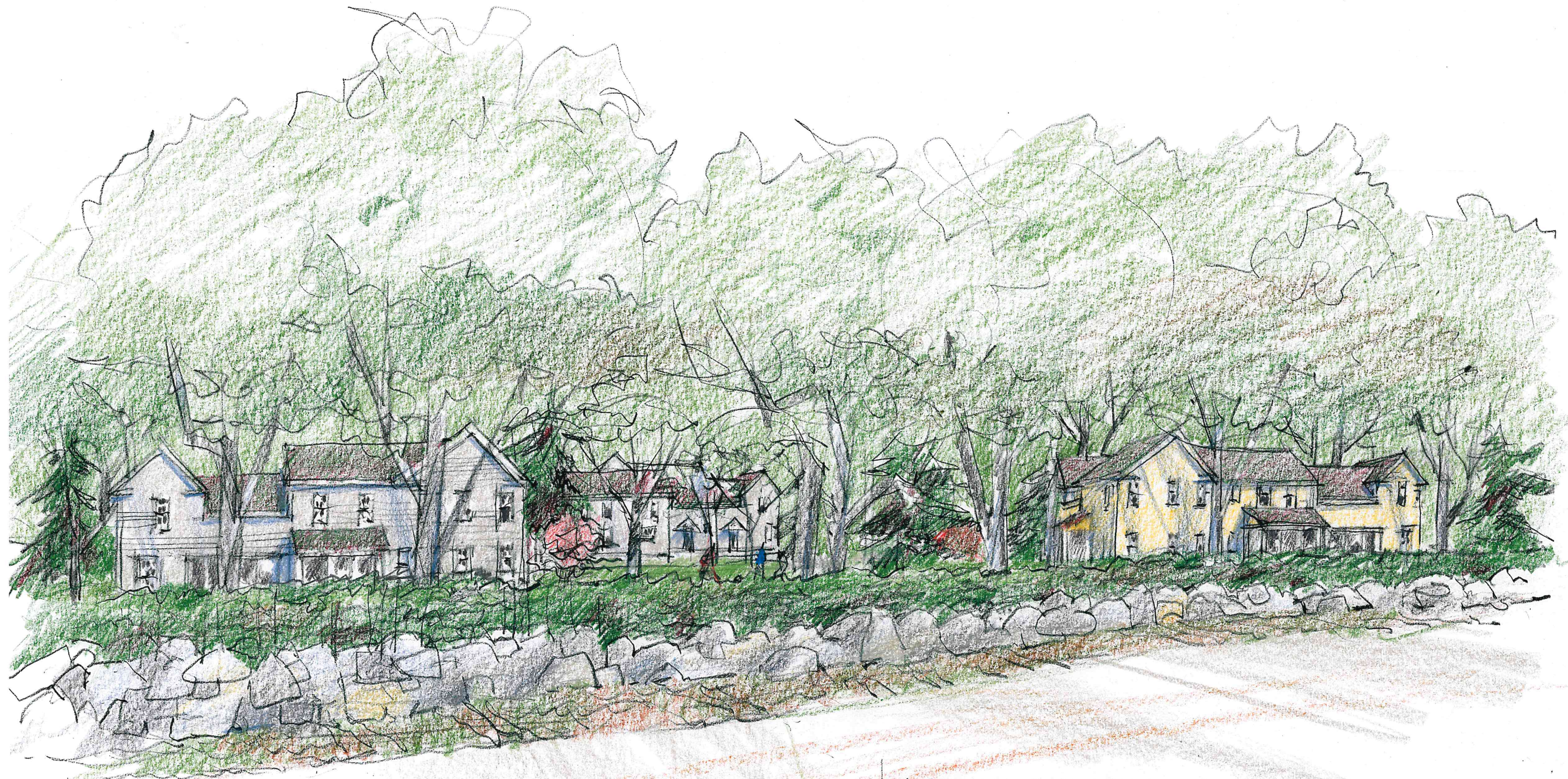
CARLETON CUSHING HOUSING - NORWELL, MA. VIEW FROM LINCOLN STREET STREKALOVSKY ARCHITECTURE