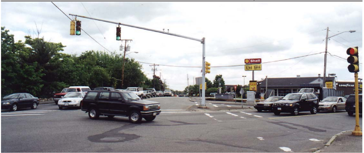
Intersection of Route 53 and 228