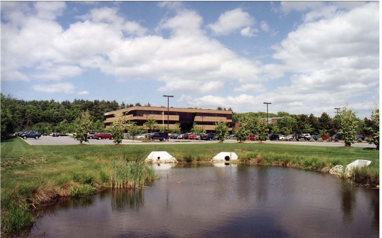
Assinippi Industrial Park

Church Hill to Wompatuck State Park, and (2) along the North River and Second Herring Brook from Stetson Meadows to Black Pond. Each of these potential greenway systems contains diverse natural resources, historic sites and landscapes, and opportunities for interpretive recreational trails.