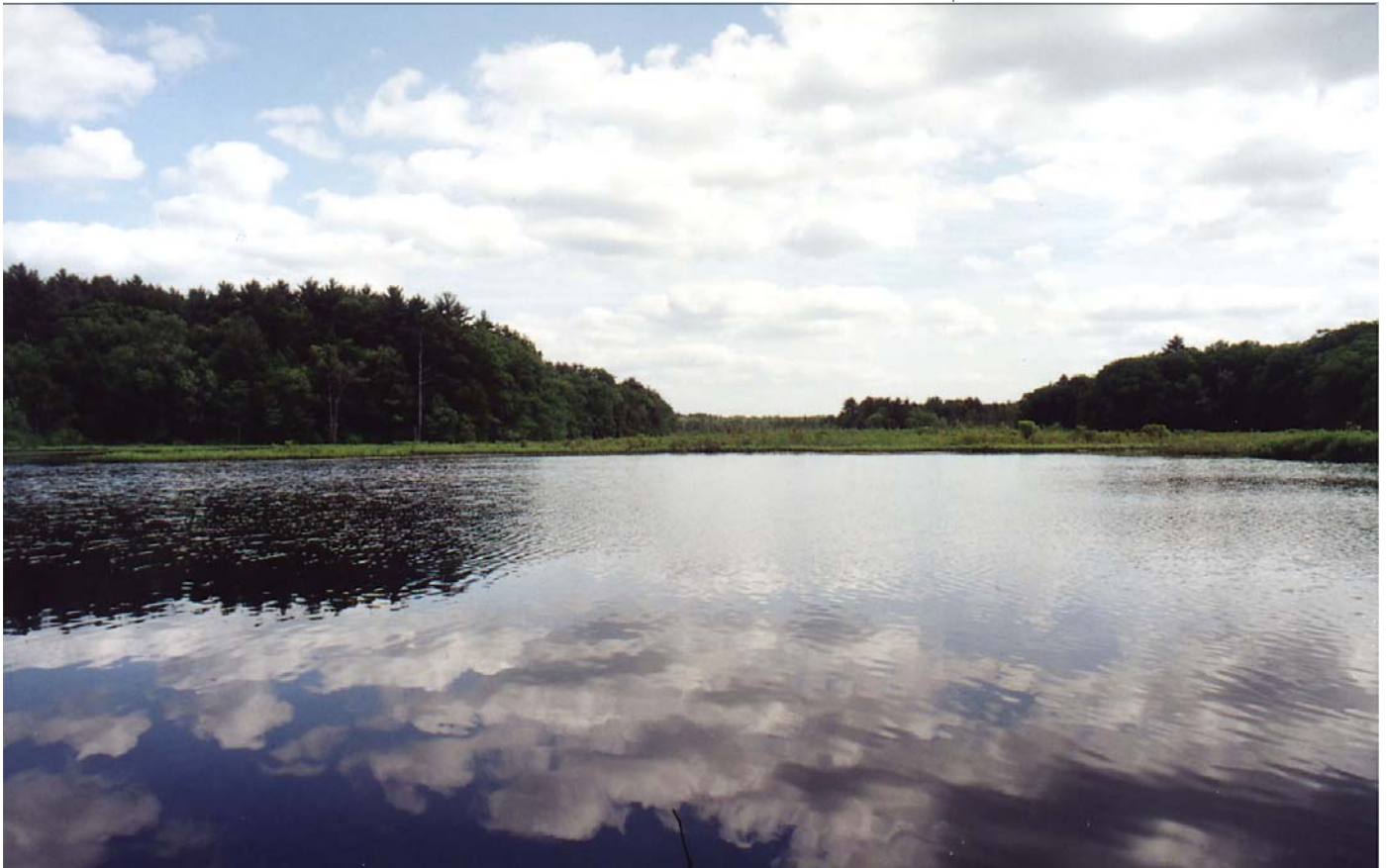
The North River

and redevelopment in order to preserve the character established by older settlement patterns. Conservation Subdivision development, which clusters homes in order to preserve larger blocks of open space, is much more likely to help Norwell retain its remaining semi-rural character than allowing conventional large-lot development patterns to continue.